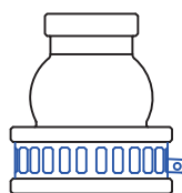
Model : FVT